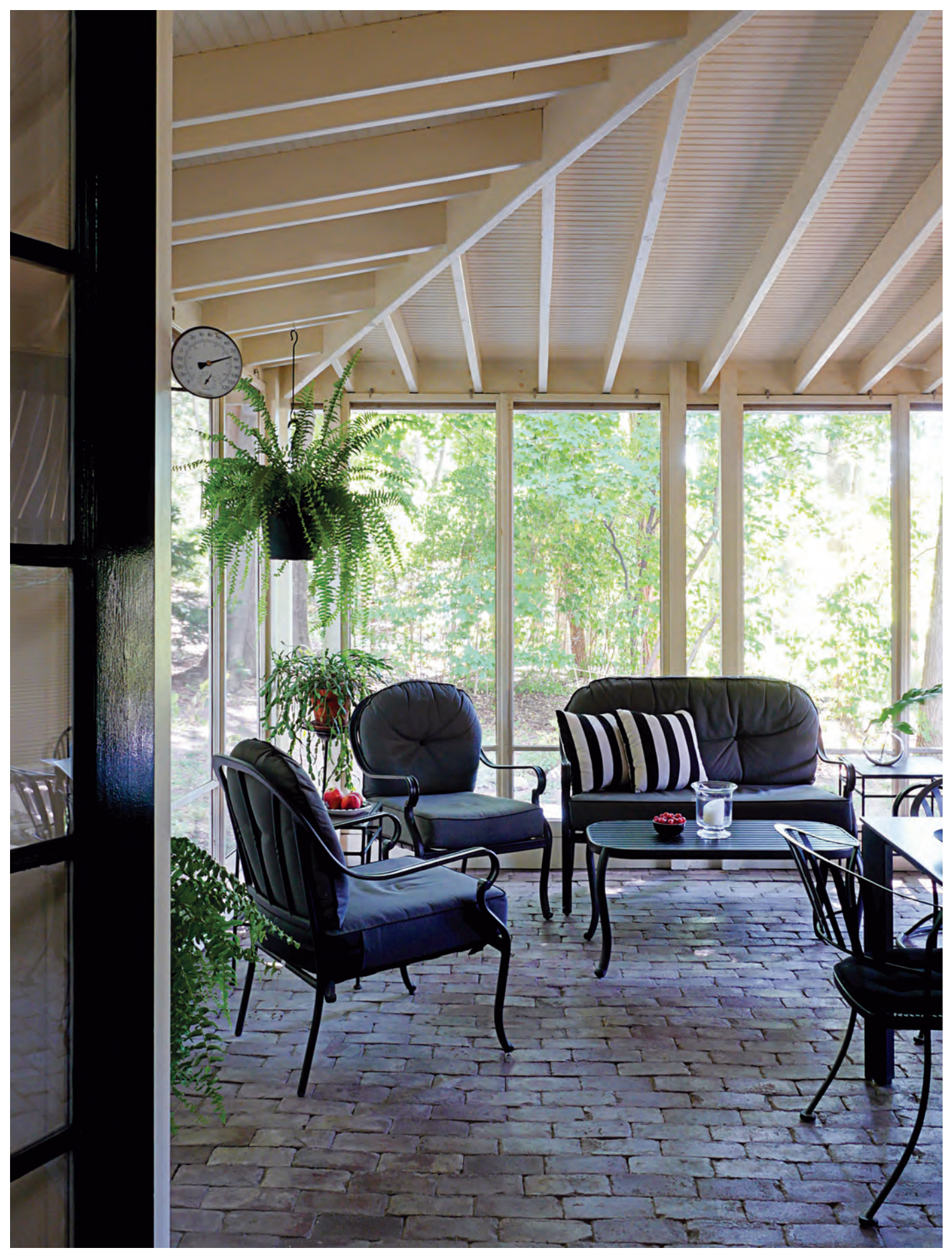
Jack and Peggy sourced as much of the renovation materials as possible—including the bricks on the screened-in porch floor—and even the kitchen sink.